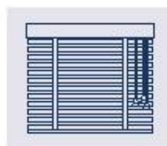
Height control and angle control on right