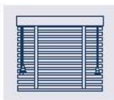
Height control on right, angle control on left

Blinds are supplied with cord tilt mechanism only