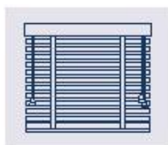
Height control on left, angle control on right